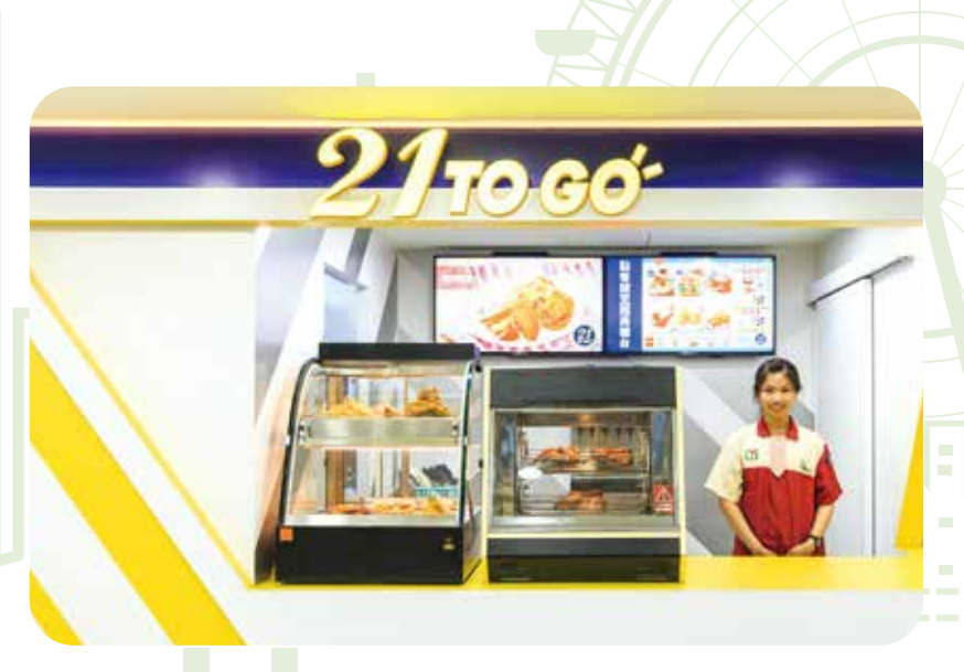
7-ELEVEN Kan Cheng Store, Kaohsiung