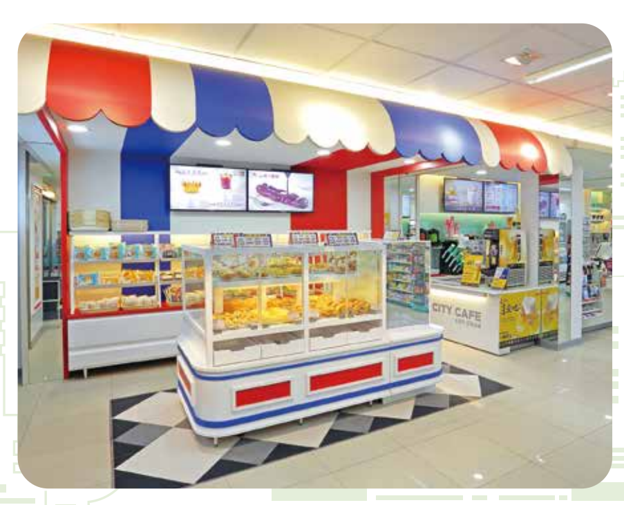
7-ELEVEN Kan Cheng Store, Kaohsiung