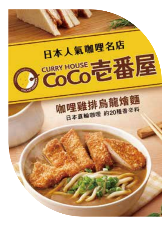
Cooperation with well-known restaurant and chef_7-ELEVEN X COCO Curry House