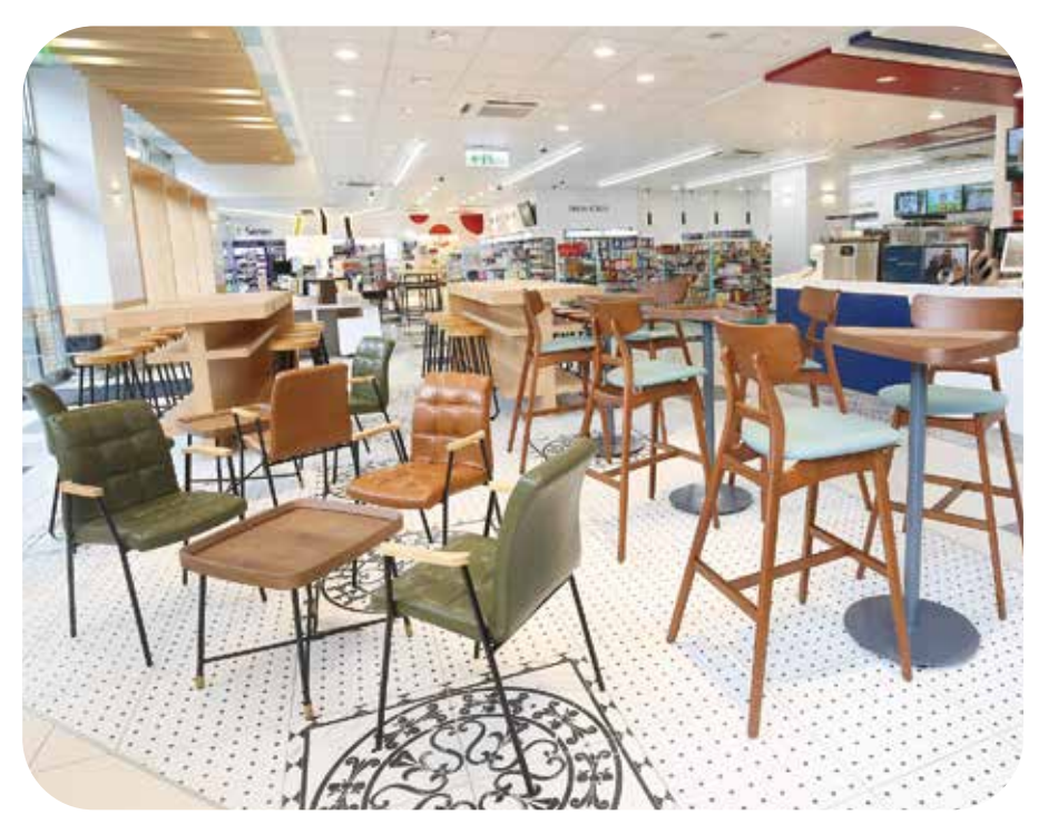
7-ELEVEN Bo Yuan Store, Taipei