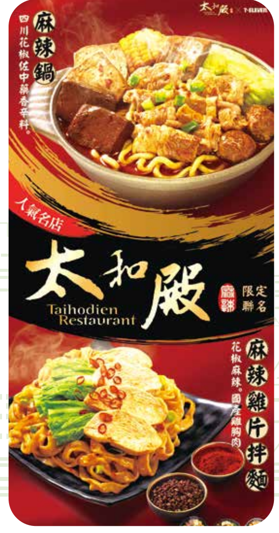
Cooperation with well-known restaurant and chef_7-ELEVEN X Taihodien restaurant