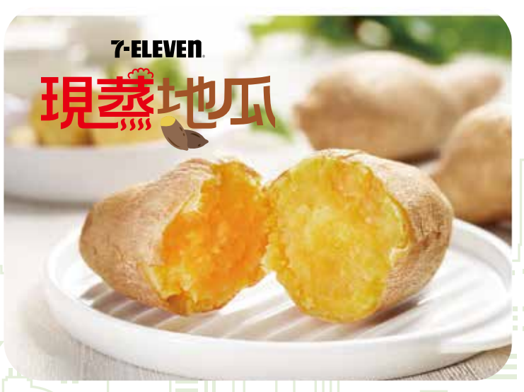
Steamed sweet potato