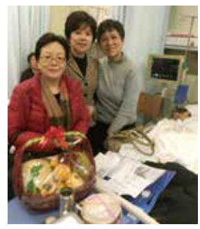
▲ A strong commitment to providing care and assistance for the most vulnerable female groups