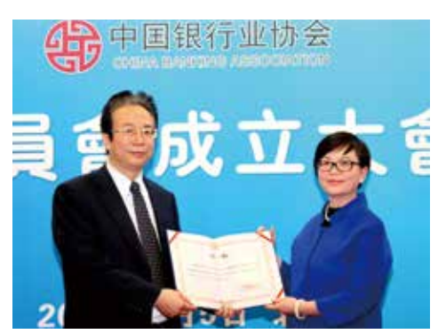
▲ Fubon Bank (China) is elected to lead the first-ever Standing Committee of the Taiwan Banking Steering Committee of the China Banking Association.