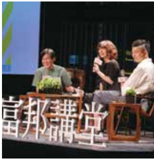
▲ 21_21 DESIGN SIGHT, organizer of the "Measuring: This much, That much, How much?" exhibition, invited as guest speaker at Fubon Forum