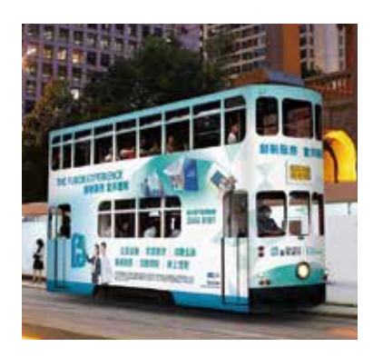
▲ Advertising campaign carrying the theme "THE FUBON EXPERIENCE"