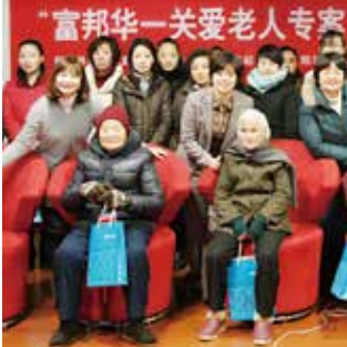
▲ A fracture insurance policy offered to female seniors wins praise from the community and the All-China Women's Federation.