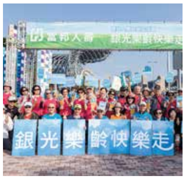
Fubon Life holds regular race-walking events and lectures that encourage healthy habits and exercise.