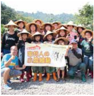
Fubon EDU's environmental day trips featuring hands-on rice-farming experience