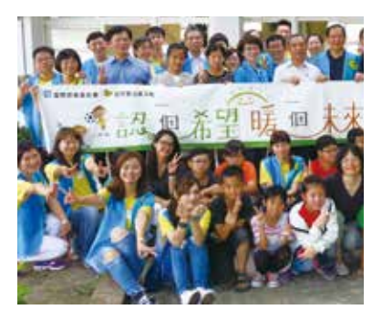
Students in Chiayi County unlock their creativity by painting their schools during the "Make a Wish, Build a Future" campaign.