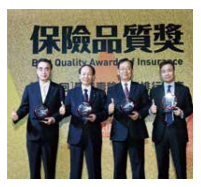
Fubon Insurance has been selected as Most Admired P&C Insurance Company for 16 straight years.