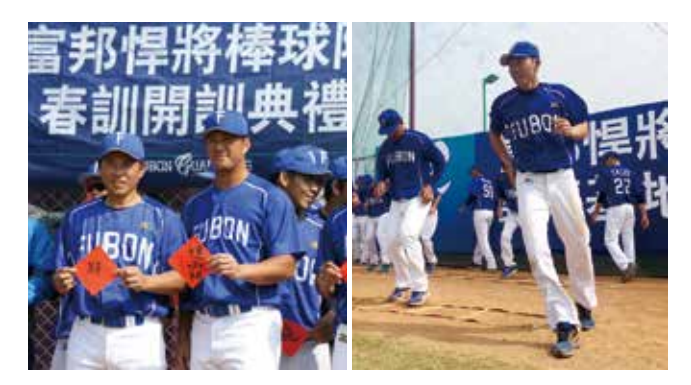
The Fubon Guardians' debut marks a historic moment for professional baseball in Taiwan.

Fubon Sports & Entertainment is a subsidiary of Fubon Financial Holding Venture Capital, a member company of Fubon Financial Holdings. Fubon Sports & Entertainment owns and operates sporting franchises including the Fubon Braves and the Fubon Guardians, making it the only corporation that owns teams at the highest level of sports in both Super Basketball League (SBL) and Chinese Professional Baseball League (CPBL) and underscoring Fubon Financial Holdings' long-standing commitment to sport.