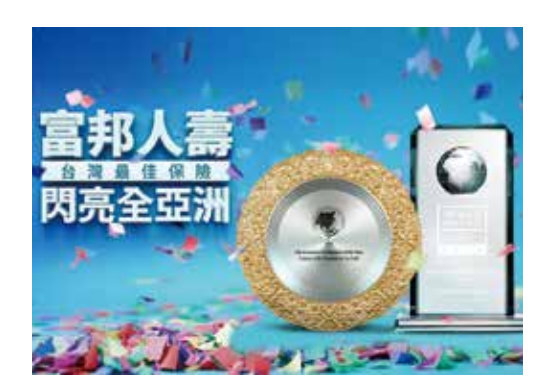
Numerous awards at home and abroad recognize Fubon Life for demonstrating exemplary leadership.