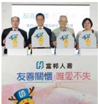
Fubon Life provides solutions, network and services that support healthy and happy aging.

Against a backdrop of low interest rates and declining profitability, Fubon Life delivered excellent financial performance in 2016. Net profit totaled NT$28.688 billion, or NT$4.13 per share. Firstyear and total premiums were NT$204.3 billion and NT$493.6 billion, respectively. Throughout the year, the company earned accolades from industry and news publications recognizing its exceptional leadership in operational performance, client service and involvement in the community. Asia Insurance Review named Fubon Life as Life Insurance Company of the Year and Insurance Company of the Year for Agents in 15 Asia-Pacific countries. World Finance awarded it Best Life Insurance Company, Taiwan for the fifth time. 2016 also marked the sixth consecutive year that Fubon Life was selected by finance and insurance graduates as the best company to work for. Other honors included a stellar number of 16 awards from the 18th Faith, Hope, and Love Awards, and first place in the Life Insurance category in CommonWealth Magazine's Golden Service Award.