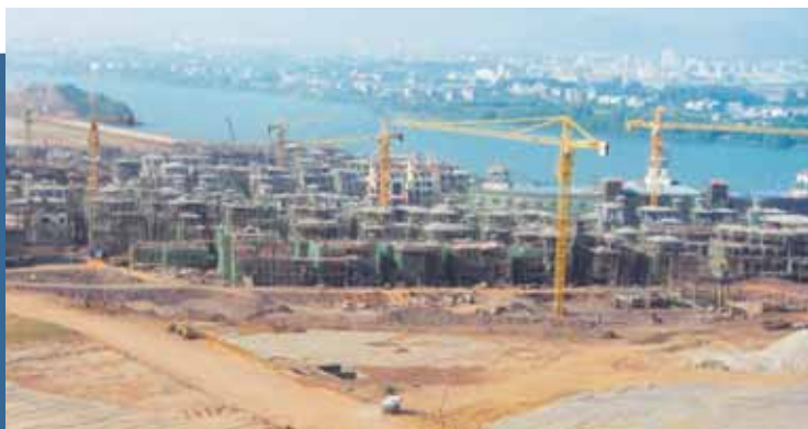
CSC Heyuan – under development 在建中的河源華南城

河源華南城位處中國廣東省河源市，一期規劃發展包括商業配套住宅配套設施。於2009年6月，河源華南城購得一幅建築淨佔地面積約487,000平方米的土地，總代價約為人民幣73百萬元。於2010年8月，河源華南城購得另一幅面積約651,000平方米的土地，總代價約人民幣97.7百萬元。建設工程已經展開，預期於未來兩年將建成面積約260,000平方米。我們計劃於2010年12月推出部分物業作銷售。