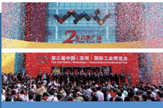
The 3rd China (Shenzhen) International Industrial Fair 第三屆中國(深圳)國際工業博覽會