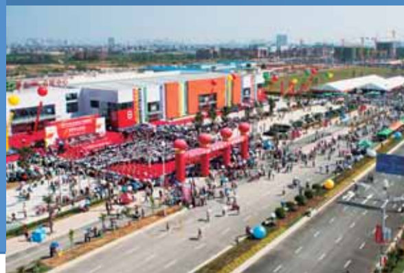
China-ASEAN Light Industrial Products Fair 中國-東盟輕工產品展覽會