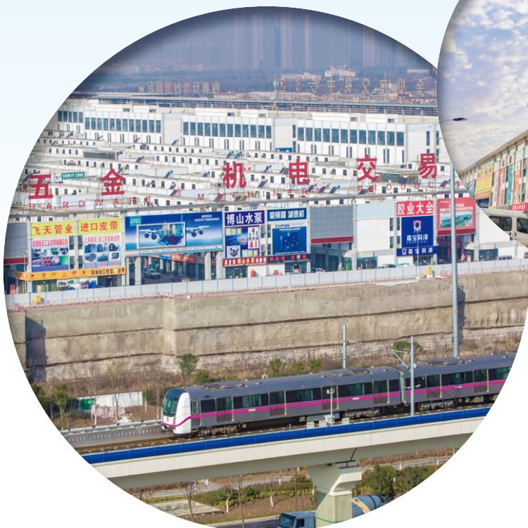
Hardware and Machinery Trade Center Zone B and Subway in CSC Xi'an 於西安華南城的五金機電交易中心B區及地鐵