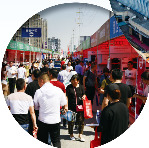
Building and Decoration Materials and Hardware Exhibition in CSC Zhengzhou 於鄭州華南城的建材家居五金展銷會