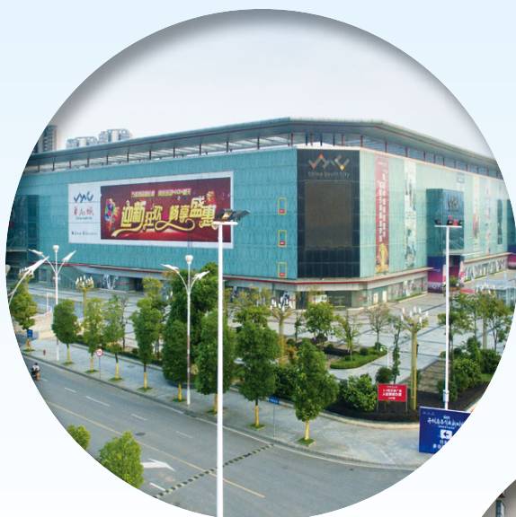
Trade centers in CSC Nanchang 於南昌華南城的交易廣場