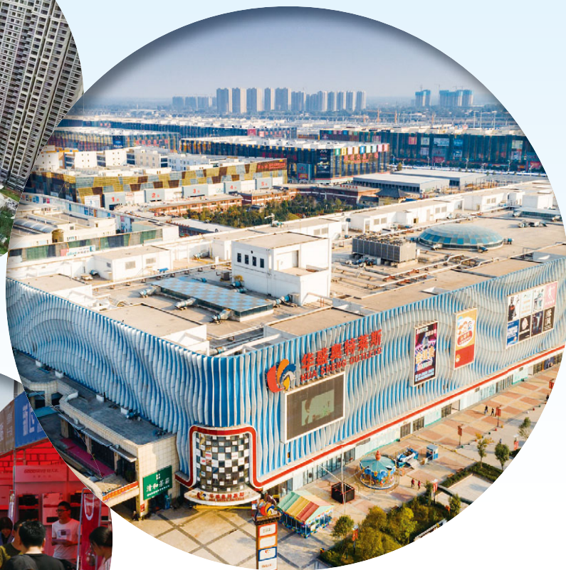
Birdview – CSC Zhengzhou 鄭州華南城鳥瞰圖