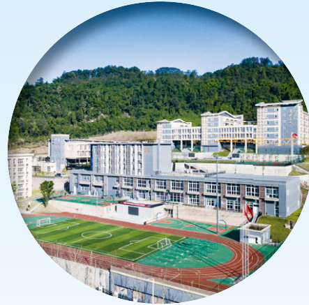
Schools in CSC Chongqing 於重慶華南城的學校

CSC Chongqing is now in operation and is in the stage of continuous development and construction. It covers industries including small commodities, hardware and machinery, hotel supplies, building and decoration materials, textiles and clothing, automobile and parts, lightings and lamps, outlets, culture and education, metals, etc., on its trade center premises. A primary school and a secondary school are established in the project to cope with the demand in the course of development.