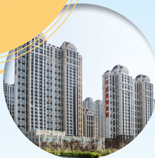
Residential ancillary in CSC Harbin 於哈爾濱華南城的住宅配套