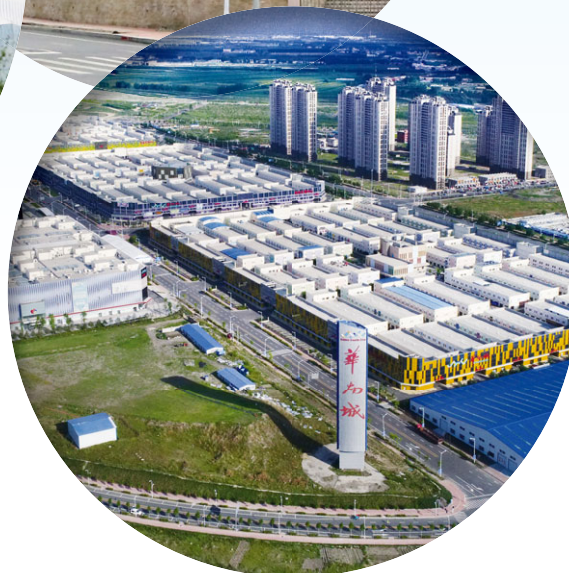
Birdview – CSC Harbin 哈爾濱華南城鳥瞰圖