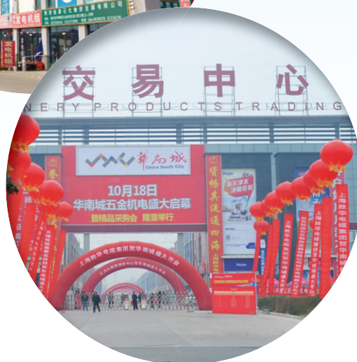
Hardware and Machinery Products Trade Center Zone B Opening in CSC Xi'an 於西安華南城的五金機電交易中心B區開業