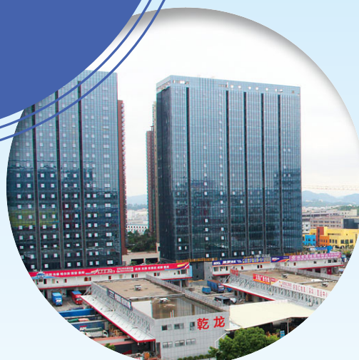
Integrated logistics area in CSC Shenzhen 於深圳華南城的綜合物流園區