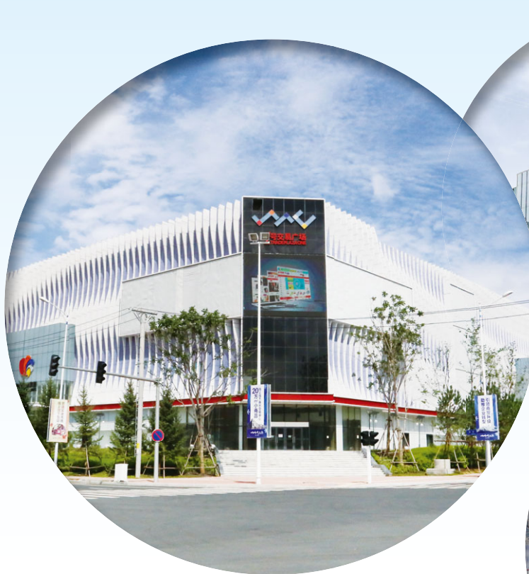
Outlets in CSC Harbin 於哈爾濱華南城的奧特萊斯