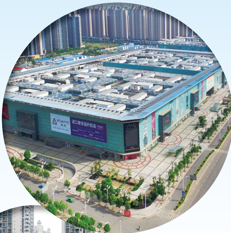
Birdview – CSC Nanchang 南昌華南城的鳥瞰圖