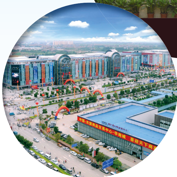
Birdview – CSC Nanning 南寧華南城的鳥瞰圖