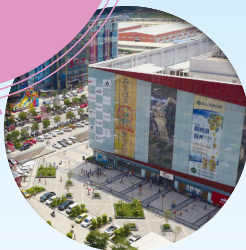
CSC Nanning in operation 營運中的南寧華南城