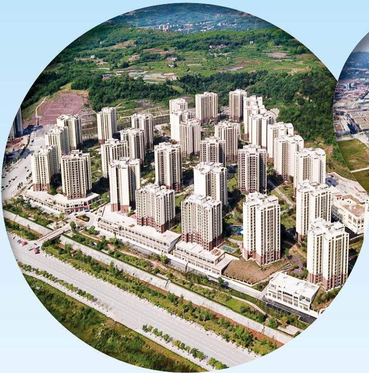
Residential ancillary in CSC Chongqing 於重慶華南城的住宅配套