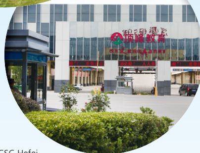
Private education center in CSC Hefei 於合肥華南城的教育中心

CSC Hefei is now in operation and is in the stage of continuous development and construction. It covers industries including automobiles and parts, hardware and machinery, building and decoration materials, textiles and clothing, hotel supplies, outlets, culture and education, small commodities and non-staple food, etc. A secondary school and a primary school are going to be established in the project to cope with the demand in the course of development.