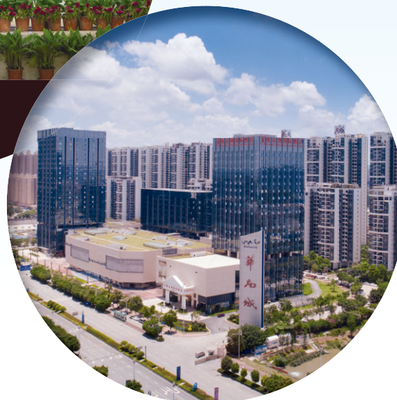
1668 Plaza and residential ancillary in CSC Nanning 於南寧華南城的1668廣場及住宅配套