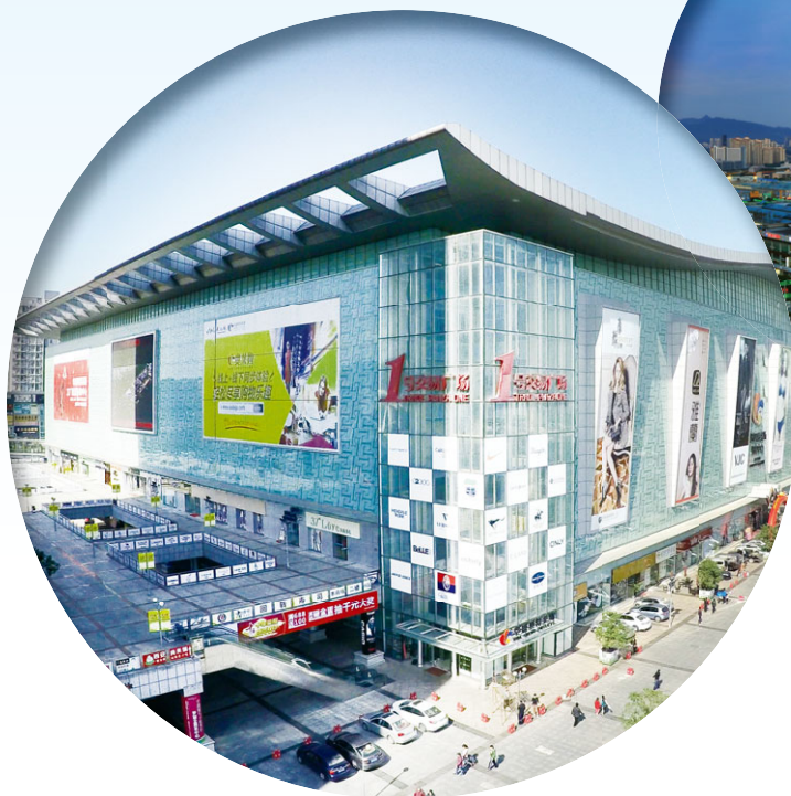
Plaza 1 in CSC Shenzhen 於深圳華南城內的1號交易廣場