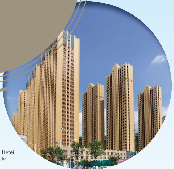
Residential ancillary in CSC Hefei 於合肥華南城的住宅配套