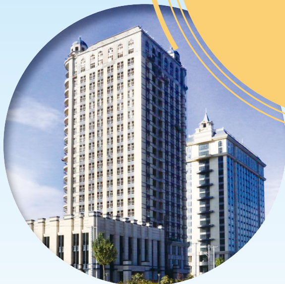
Multi-purpose properties in CSC Harbin 於哈爾濱華南城的多功能物業