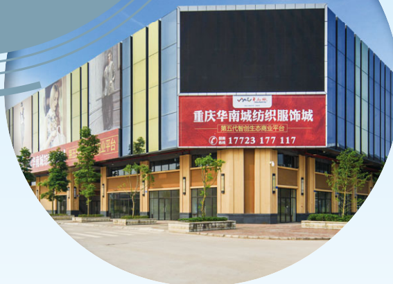
Textile and Apparel Trade Center in CSC Chongqing 於重慶華南城的紡織服飾城