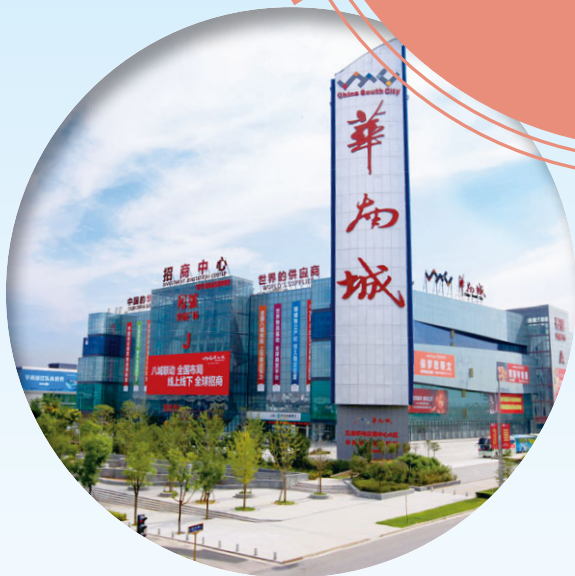
Plaza 2 in CSC Xi'an 於西安華南城的2號交易廣場