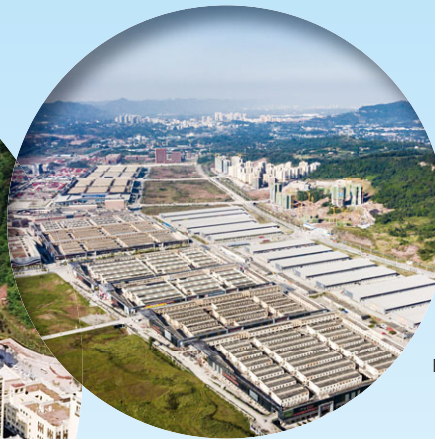
Birdview – CSC Chongqing 重慶華南城鳥瞰圖