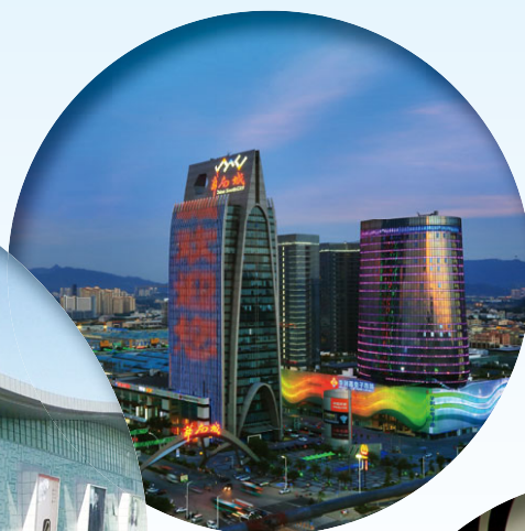
Multi-purpose properties in CSC Shenzhen 於深圳華南城的多功能物業