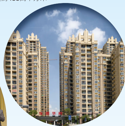
Residential ancillary in CSC Nanning 於南寧華南城的住宅配套