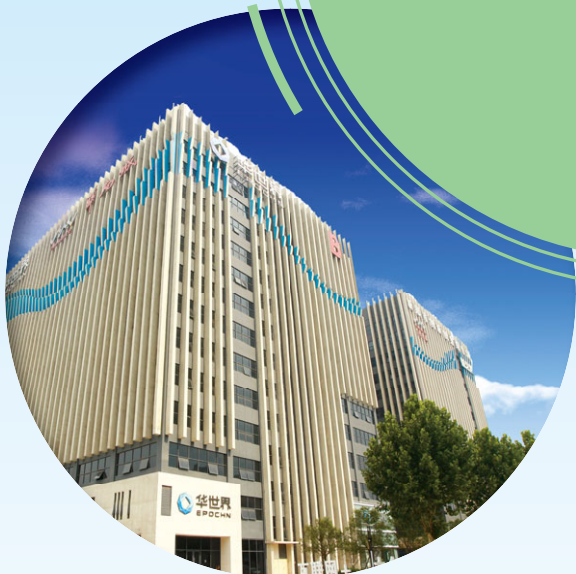
E-commerce buildings in CSC Zhengzhou 於鄭州華南城的電商大廈