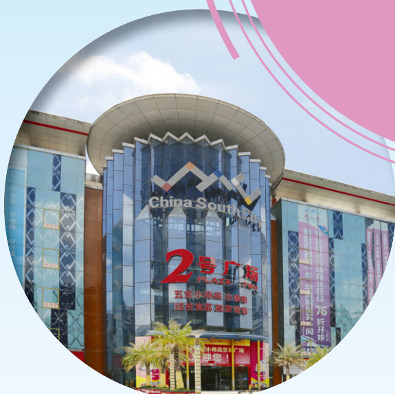
Plaza 2 in CSC Nanning 於南寧華南城的2號廣場