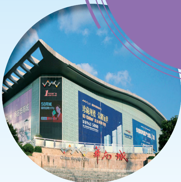
Plaza 1 in CSC Nanchang 於南昌華南城的1號交易廣場

Residential properties in CSC Nanchang 於南昌華南城的住宅物業