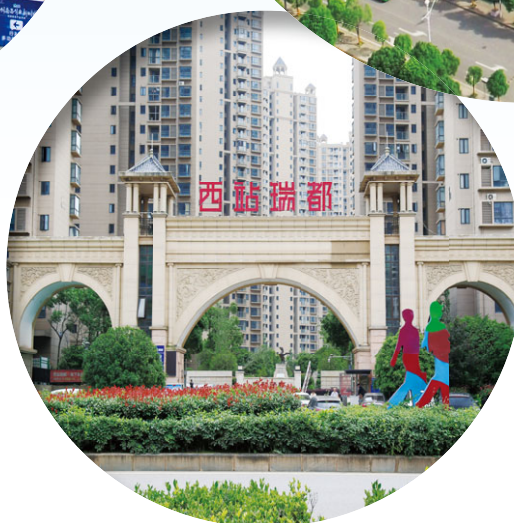
Residential ancillary in CSC Nanchang 於南昌華南城的住宅配套