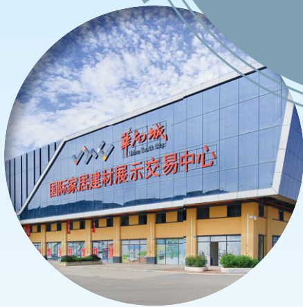
Trade center in CSC Chongqing 於重慶華南城的商品交易中心