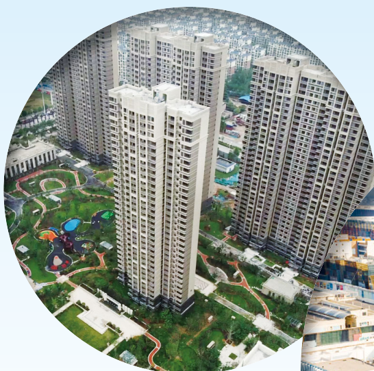
Residential ancillary in CSC Zhengzhou 於鄭州華南城的住宅配套

鄭州華南城總規劃淨佔地面積約700萬平方米，總規劃建築面積約為1,200萬平方米。