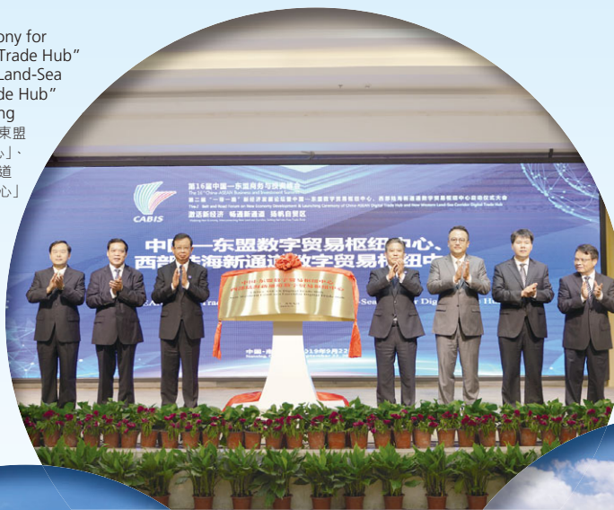
Launching Ceremony for "China-ASEAN Digital Trade Hub" and "New Western Land-Sea Corridor Digital Trade Hub" in CSC Nanning 南寧華南城「中國東盟 數字貿易樞紐中心」、 「西部陸海新通道 數字貿易樞紐中心」 啟動儀式