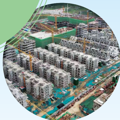
Multi-purpose properties under construction in CSC Zhengzhou 於鄭州華南城的在建中的多功能物業