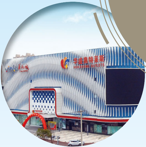
Outlets in CSC Hefei 於合肥華南城的奧特萊斯